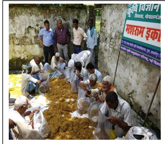
Oyster mushroom training