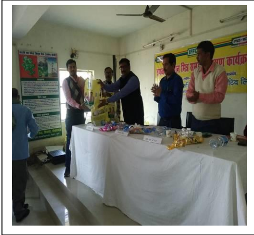
Sponsored IFFCO training