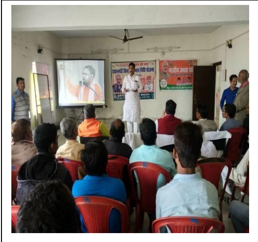
Hon. MP addressing Farmers