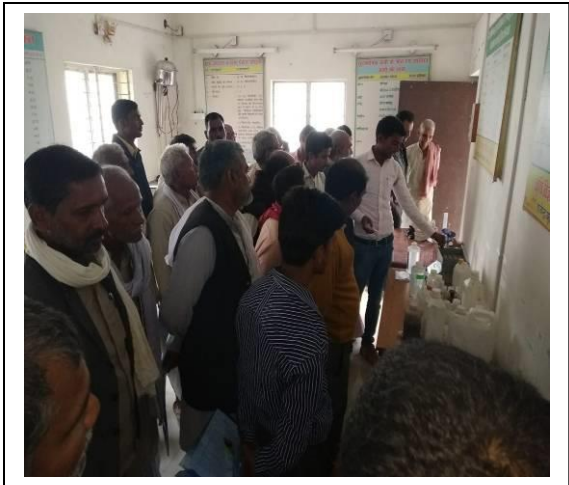
Soil testing lab (minilab)