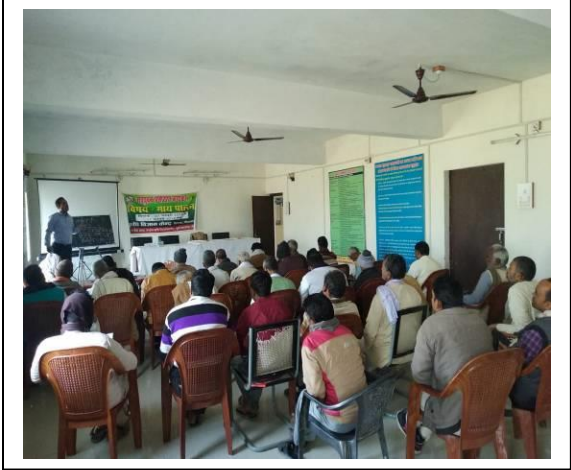
Training in session