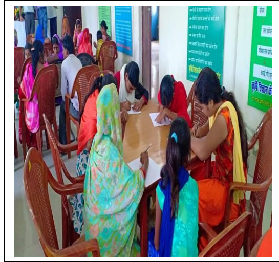
Drawing, essay competition