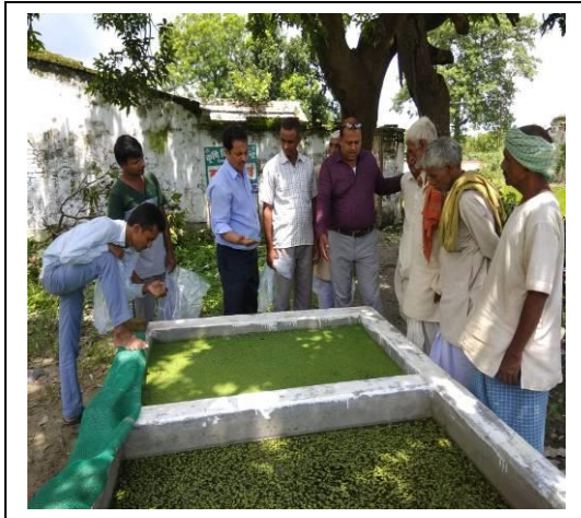
Azolla unit shown to farmers