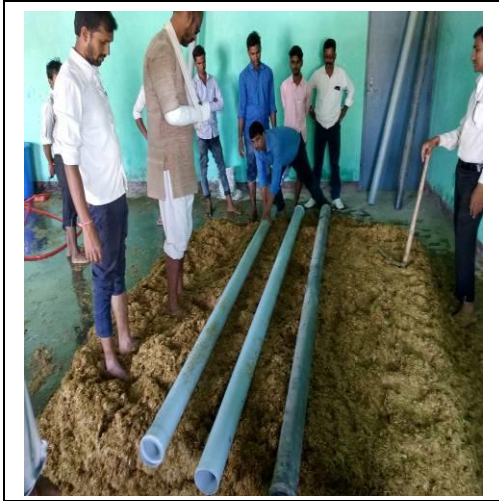
Button mushroom training