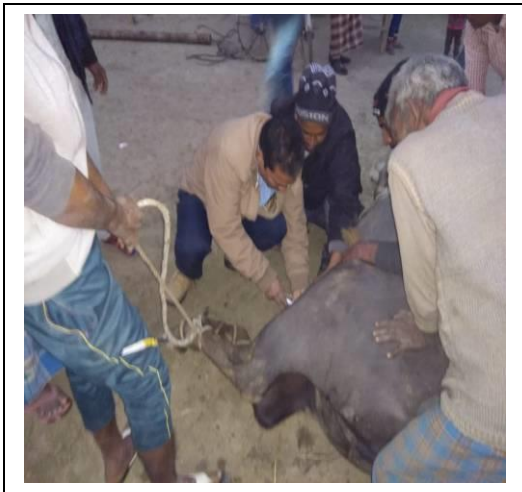
Mastitis case treatment (Diagnostic visit)