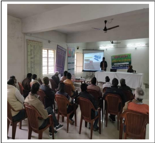
Farm Mechanization training