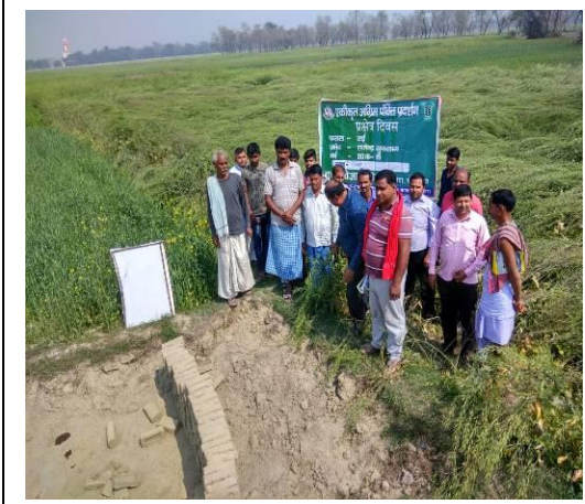
Field Day on R. Suflam