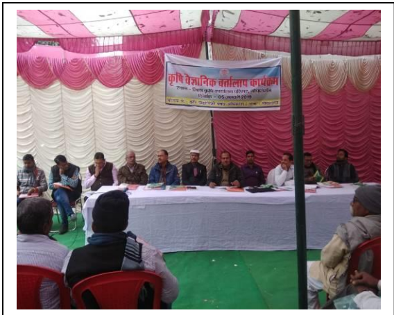
Farmer- Scientist Interaction